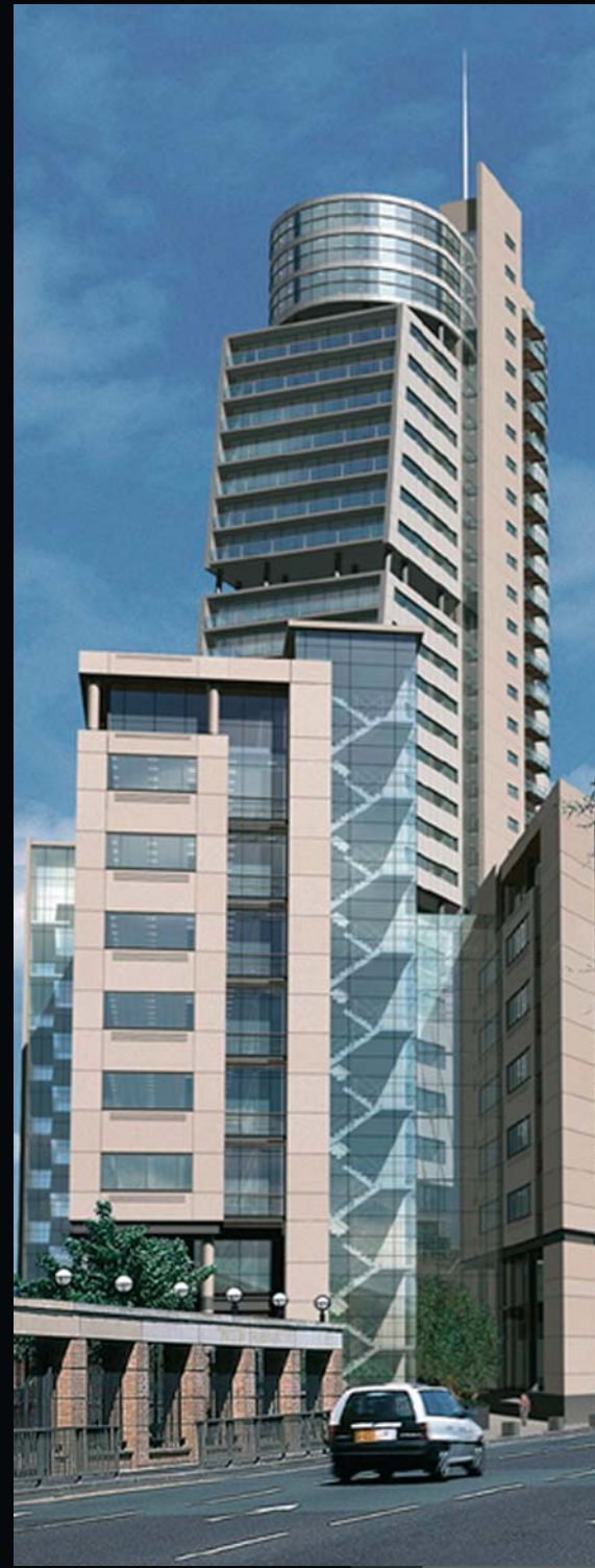
Bridgewater Place, Leeds

Architect: Aedas Contractor: Bovis Lend Lease