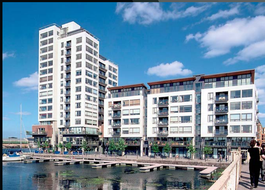
Charlotte Quay, (Millennium Tower) Dublin

Architect: O'Mahony Pike Contractor: Danninger Ltd.