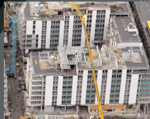
Spencer Dock, Dublin

Architect: O'Mahony Pike Contractor: John Sisk & Son