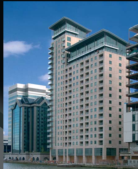
Discovery Dock, London

Architect: Shepherd Design Contractor: Shepherd Construction