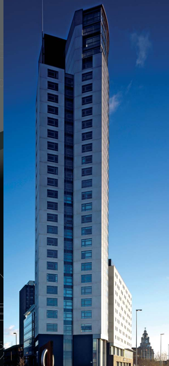
Old Hall Street, Liverpool

Architect: Abbey Holford Rowe Contractor: Carillion Building