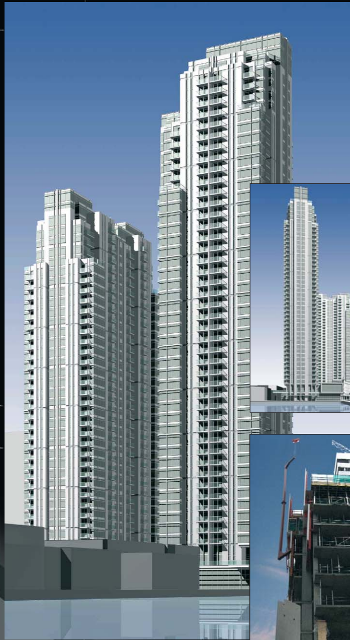
1 Millharbour, Isle of Dogs, London

Architect: SOM Contractor: Ballymore Properties