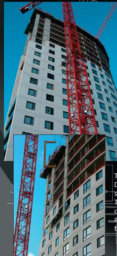
Clarence Dock, Leeds